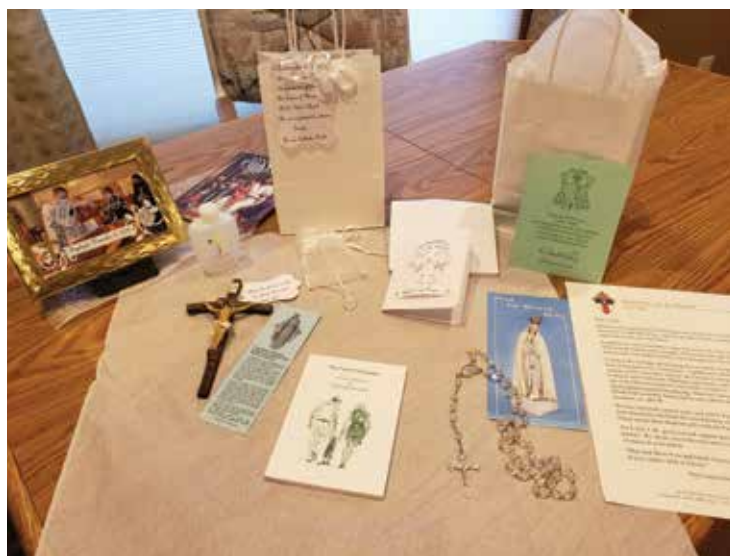
Items that are included in the gift bag