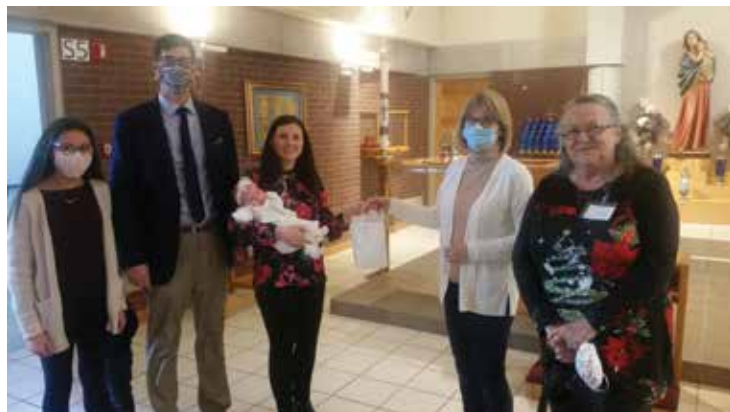
Parents receiving the gift bag at the Baptism

Our parish legionaries imitate the charity of the Blessed Mother by visiting every family or individual that registers